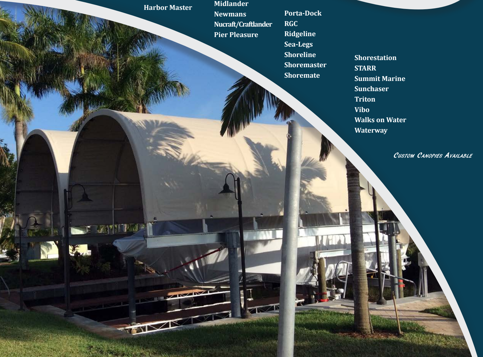
Custom Canopies Available

Rush-Co offers in-house engineering on custom covers, boat house covers and extended valances for all makes and models.