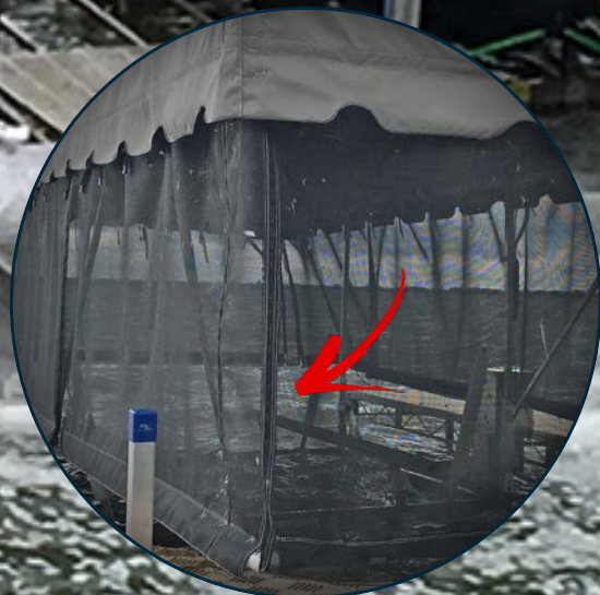
ZIPPER IN EACH CORNER FOR INDIVIDUAL PANEL REPLACEMENT