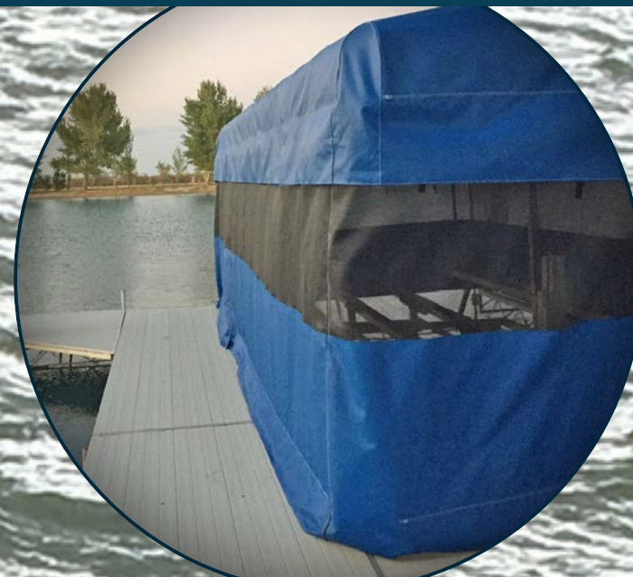
5 FT MESH-VINYL CURTAIN