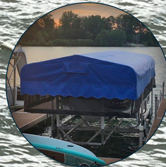
3 FT MESH CURTAIN