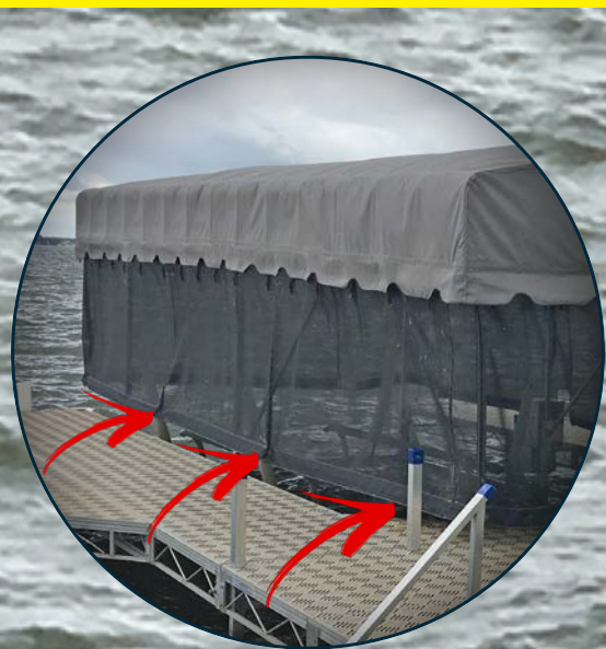
SIDE RELEASE ATTACHMENT CLIPS