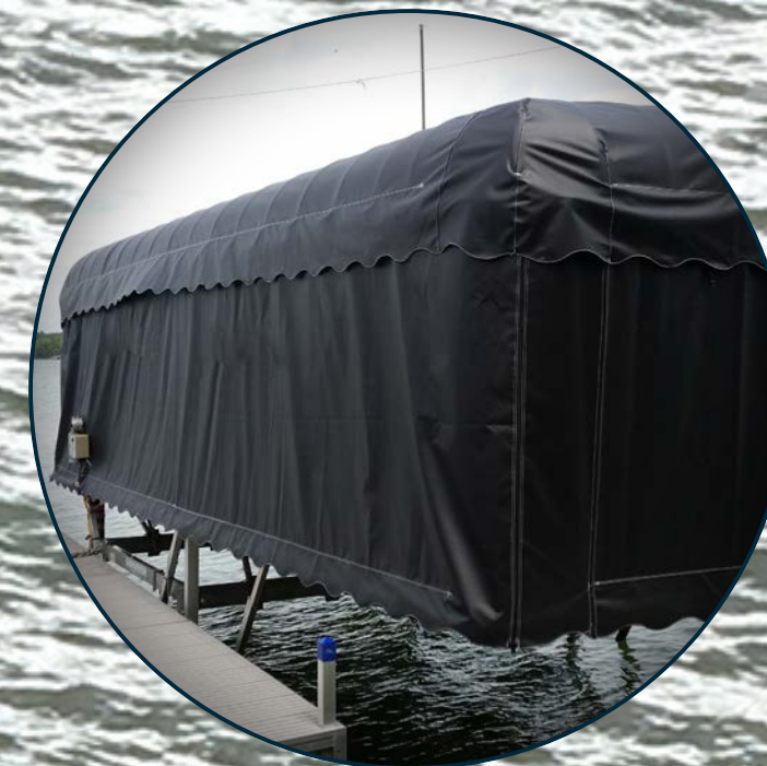
5 FT VINYL CURTAIN